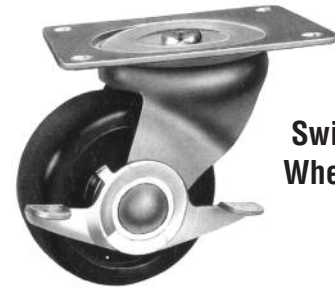
Swivel with Wheel Brake